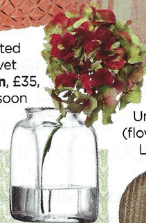
Umberto vase , £36 (flowers not included), LSA International