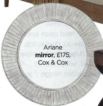
Ariane mirror , £175, Cox & Cox