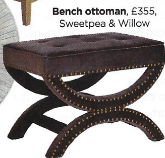
Bench ottoman , £355, Sweetpea & Willow