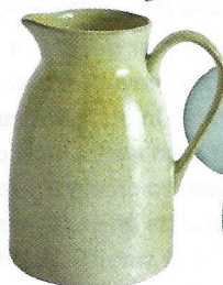
Amalfi pitcher , £16, Dunelm