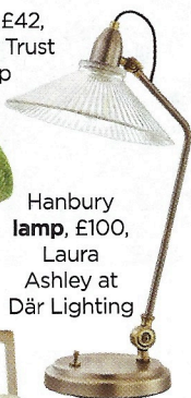
Hanbury lamp , £100, Laura Ashley at Där Lighting