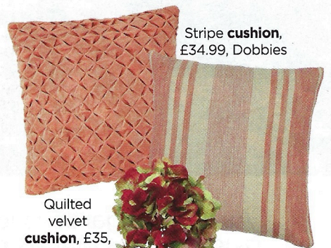
Stripe cushion , £34.99, Dobbies