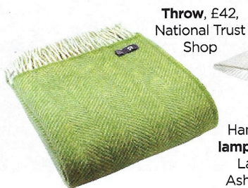
Throw , £42, National Trust Shop