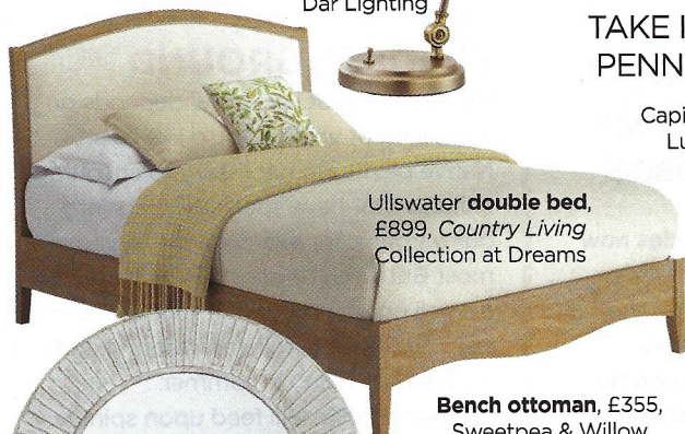
Ullswater double bed , £899, Country Living Collection at Dreams